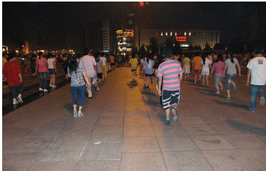
Figure 1 Dancing in a Beijing square.