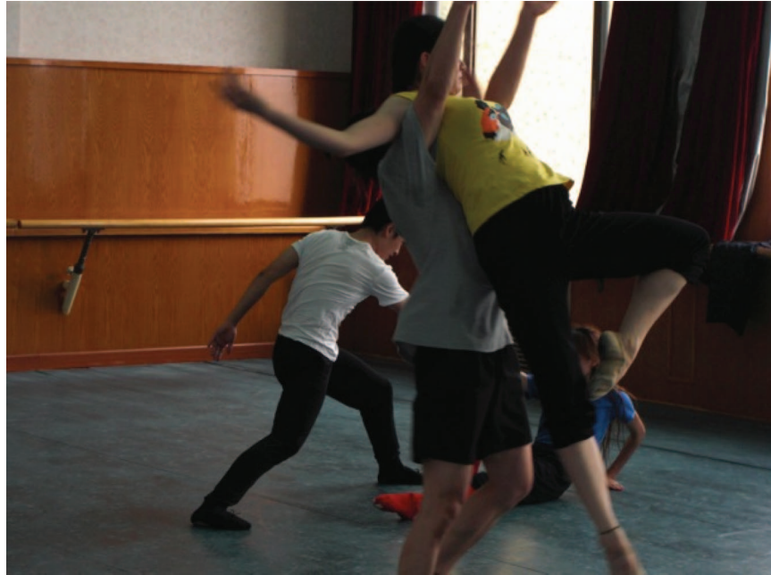
Figure 4 BDA dancers rehearsing Cleave .

During the process I notice how Kerry's choreography requires dancers to break with codified movement at times and move into pedestrian action. For example, walking from one place to another, between dance phrases, to meet another dancer.