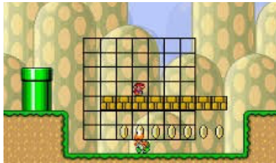
Figure 1: A visual representation of the PLATFORMERSAI toolkit with the vision grid around the agent.

The Problem Space is defined by all actions an agent can perform. Within the game, agent A has to solve the complex task of selecting the appropriate action each given frame. The game consists of A traversing a level which is not fully observable. A level is 256 spatial units long, and A should traverse it left to right. Each level contains objects which act in a deterministic way. Some of those objects can alter the player’s score, e.g. coins. Those bonus objects present a secondary objective. The goal of the game, move from start to finish, is augmented with the objective of gaining points. A can get points by collecting objects or jumping onto enemies. To make it comparable to the experience of similar commercial products we use a realistic time frame in which a human would need to solve a level, 200 time units. The level observability is limited to a 6 \times 6 grid centred around the player, cf. [9]. The restriction to a smaller grid is only necessary to reduce the number of generations the system needs to converge towards good results as the grid size has an exponential affect on the convergence time.