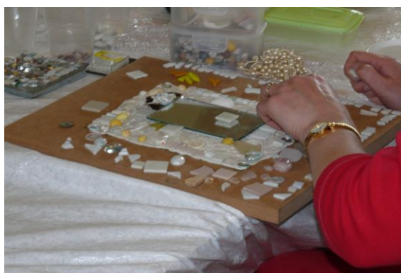
Figure 6.5. Combining a variety of found materials in the Pendon Crafts Group

is 'brought into play'. The capacity to throw together materials in this ad hoc way is analogous to a creative relationship to the more general 'thrownness' (Heidegger, 1962 [1927]) of situated embodiment and cognition: a condition of being 'thrown into something, delivered over to something, given over to something from which we have to start and with which we must deal', and which 'is never neutral or undetermined but always has some definite content already' (Withy, 2014, p.62)