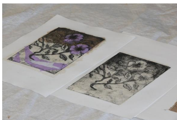
Figure 10.3. Finished prints produced by a member of the Pendon Crafts Group