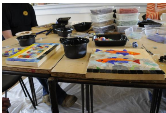
Figure 9.2. Struggling with a creative problem in the Pendon Crafts Group