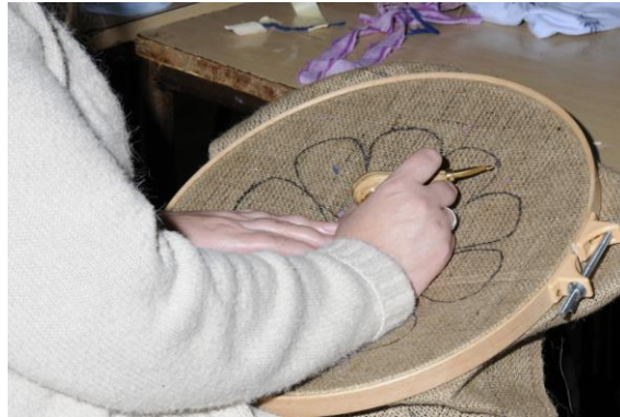
Figure 1.1. Rug-hooked textile at the outline stage in the Pendon Crafts Group

This thesis presents an ethnographic study of groups using crafts activities to support psychological wellbeing in community and primary care settings. Investigation was carried out primarily through sustained participant observation as facilitator and volunteer in two such groups. No ‘essential’ characteristics of crafts creativity or group belonging were presumed. Observation was closely focused on the making processes in which participants were involved, and the physical, interpersonal, and community interactions that organized themselves around crafting and crafted artefacts. This in vivo account of the material, processual, relational, and situated dimensions of group making was supplemented by interviews with a range of UK arts for health organizations. Findings have distinctive implications for good practice and for further research.