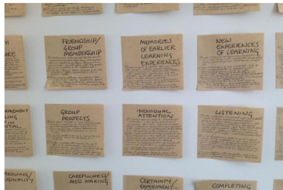
Figure 3.3. Generating notes on codes

Whilst these superordinate categories formed a temporary holding arrangement for a large number of disparate themes, writing the thesis along these lines would not have adequately represented what was most of interest in the material, particularly because these fragmented typologies uprooted affect and interaction from the sequential processes in which they were embedded. In order to clarify the strengths, weaknesses, and interrelationship of my codes, I generated some theoretical notes on each of them. Each of the ninety codes was allocated a post-it note, to which I added my thoughts concerning on the original justification for its creation, and problems associated with its use (for example duplication, limited relevance, over-applicability, vagueness, or loss of meaning when treated in isolation). I also noted any striking links with other codes.