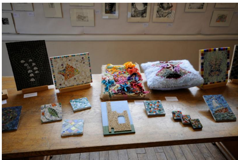
Figure 8.1. Finished work on display at the Pendon Craft Group’s end-of-year exhibition

The processes of creativity—the finding of form for thought—have a transformative impact on the sense of self. The embroiderer holds in her hands a coherent object which exists both outside in the world and inside her head. Winnicott’s theory of mirroring helps us understand how the experience of embroidering and the embroidery affirms the self as a being with agency, acceptability and potency . . . The embroiderer sees a positive reflection of herself in her work and, importantly, in the reception of her work by others (p.xx).