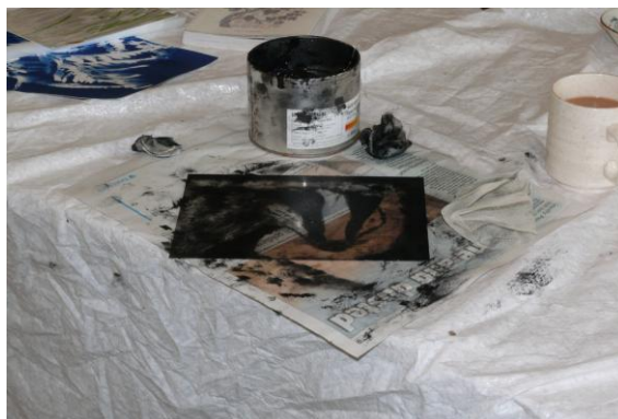
Figure 6.4. Messy drypoint printmaking in the Pendon Crafts Group

something random into a process that was unfolding with too much predictability. As Sennett (2008, p.226) suggests, ‘made difficulties embody the suspicion that matters might be or should be more complex than they seem; to investigate, we can make them even more difficult’.