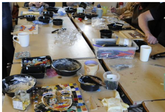
Figure 9.1. Creative atmosphere as an affective prompt in the Pendon Crafts Group