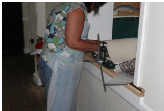
Figure 7.2. Printmaking with an etching press in the Pendon Crafts Group

A growing and interdisciplinary body of literature (for example Clark, 2001) argues that the conventional line drawn between tool user, tool, and environment is arbitrary, and that tools can usefully ‘be seen as continuous and active parts of the human cognitive architecture’ (Malafouris, 2008b). Simply holding a tool has been demonstrated to alter the functional architecture of the brain; for instance the cognitive mapping of near and far space is altered when holding a stick (Berti and Frassinetti, 2000, p.415). Consistent with this, my observations evidenced the striking effects of tool use on the capacity to imagine and to plan, as will be demonstrated below. Beyond this, any given crafts technology—the assemblage of skills connected with mosaic for instance—could become a tool for thinking or seeing. A new medium would become a lens through which bits of the visual world were reinterpreted in imagination, generating endless new possibilities, as when a participant tells me that ‘since she started doing mosaic, she’s become slightly obsessed; her mind keeps churning over how she’d translate such-and-such an image into mosaic’ (Field note, Pendon Crafts Group, 03/03/14).