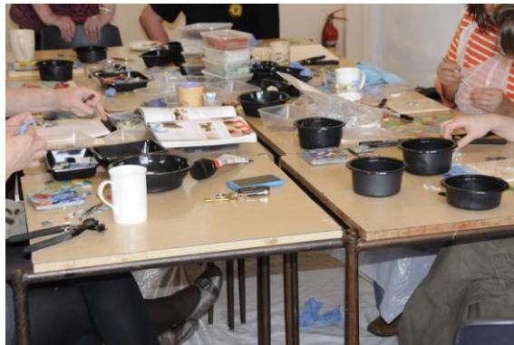
Figure 4.2. Members of the Pendon Crafts Group at work on mosaics