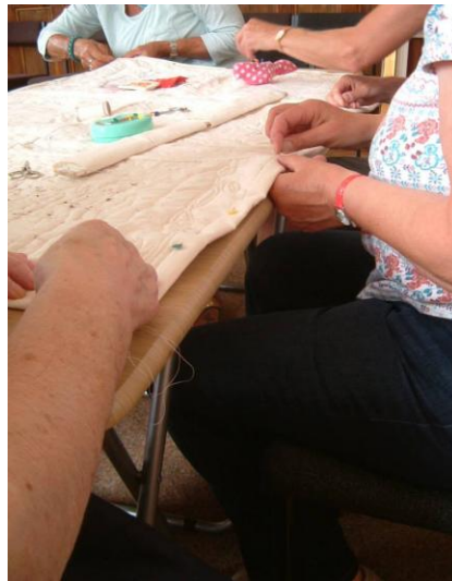
Figure 4.1. Members of the Hellan Crafts Group at work on a quilt