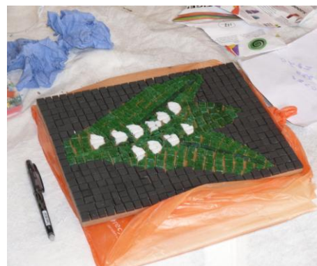
Figure 10.2. Work nearing completion in the Pendon Crafts Group

As participants accurately observed, in any creative project, ‘the final product is the input of so many things’ (Interview, ID, Hellan Crafts Group, 15/04/14). ‘Its appearance changes’ with every new addition (Field note, Hellan Crafts Group, 18/03/13), and the raw materials are constantly ‘making suggestions, as it were, about how they could make a completely different picture’ (Field note, Hellan Crafts Group, 18/07/14). This conclusion reflects on the completed thesis as ‘final product’, noting the fortuitous discoveries and unexpected obstacles that occurred en route, the learning that occurred on the journey, and how that knowledge might be used in future work. In Section 10.2, I reflect on how the thesis fulfilled its original aims, whilst inevitably becoming something slightly different from what was originally envisaged. In Section 10.3, I summarize the ways in which this thesis makes an original contribution to knowledge. In Section 10.4, I assess the implications of this contribution for good practice in the field, both at the level of facilitation, and at an organizational level. Lastly, in Section 10.5, I extend this discussion to the implications of the current project for further research in this area, and make some suggestions about how impacts on wellbeing might be reconceptualized in crafts- and arts-for-health research, in order to supplement