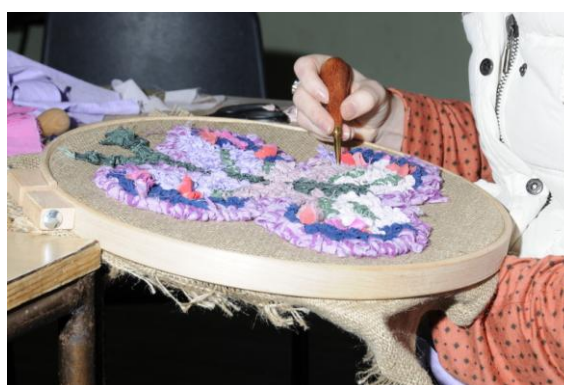
Figure 7.3. Rug hooking in the Pendon Crafts Group

Whilst practising a new skill was at times frustrating, at others it could have a beneficial impact on mood. It was well suited to answering the need expressed by a participant in a low mood who said 'I want something to put my mind into' (Field note, Hellan Crafts Group, 13/11/12) and this was particularly the situation, described in relation to flow experiences by Csikszentmihalyi (2002, p.52), when 'the challenges are just balanced with the person's capacity to act'. Practising was also satisfyingly purposive: as Sennett (2008, p.175) suggests 'doing something over and over is stimulating when organized as looking ahead'.