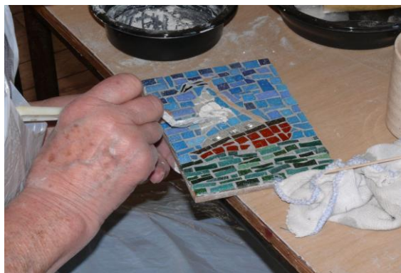
Figure 7.5. Using white grout for a white sail in the Pendon Crafts Group (Photo: David Lidstone, 2014)

practice became democratized through forms of talk, encouraged by facilitators, in which group members started to position themselves as competent judges, and to reduce the power differential created by the presumed specialist expertise or creative giftedness of facilitators.