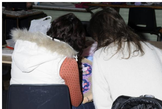
Figure 6.1. Talking and making in the Pendon Crafts Group

doing?” rather than, “what do you do?” (Field note, Hellan Crafts Group, 20/07/14).