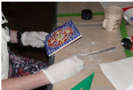
Figure 7.4. Reflecting on work in progress in the Pendon Crafts Group (Photo: David Lidstone, 2014)

Sometimes the emergence of a capacity for critical reflection represented a substantial shift from habitual attitudes of hopelessness, passivity, and indifference. One participant, for example, after insisting week after week that he planned to throw away his work, considered for the first time what he might change about it instead. In the moment described, the work becomes subject to his perceived agency, rather than out of his control: