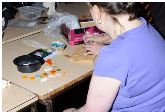
Figure 5.3. Starting a mosaic project in the Pendon Crafts Group

Although this frozen panic was often in evidence, it was also clear that participants were skilful in avoiding it, finding a multitude of pretexts for ‘not going in the water’. This avoidance kept them immobilized in another way, since they were obliged to remain within a familiar repertoire of behaviours where shame and frustration would not be encountered. As an artist, these were tactics I was familiar with, having practised them myself, witnessed them in my peers, and encountered them in other teaching, but in this context, attended by so much anxiety, they could sometimes seem intractable. Modes of avoidance included a range of forms of inactivity; they could also take the form of making that looked productive but contained elements of stalling or procrastination that got in the way of starting, progressing, or finishing creative projects.