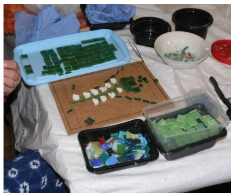
Figure 10.1. Work at the initial conception stage in the Pendon Crafts Group (Photo: David Lidstone, 2014)