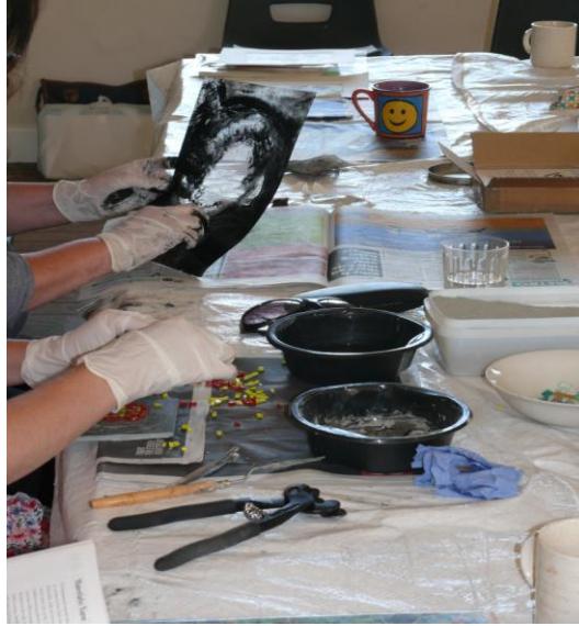
Figure 2.1. Pendon Crafts Group, drypoint etching and mosaic