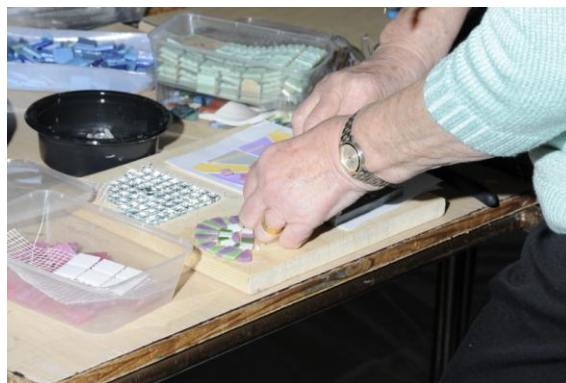
Figure 8.2. Work in development in the Pendon Crafts Group

As noted above, particularly in Chapter 5, participants often spontaneously observed that affective habits that produced difficulties with making also occurred in their activities elsewhere, for instance in relation to perfectionism or fear of trying something new. Participants' language reflected a conception of crafts creativity as analogous to everyday creativity more generally. One member comments, for example, 'I'm starting to realize this group isn't just about crafts—it's about how you live your life'; and when we talk about drawing as something as valuable at the level of process as product, she says, 'it's what people say about life, isn't it—it's better to travel than to arrive' (Field note, Pendon Crafts Group, 12/05/14). In an interview, another participant says,