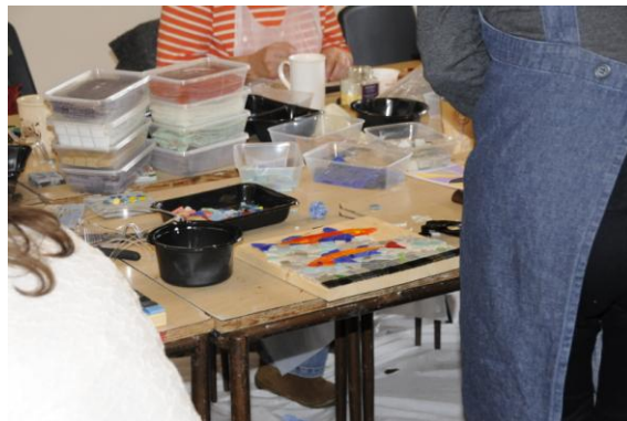
Figure 3.1. At work, aproned on the right, as participant researcher in the Pendon Crafts Group