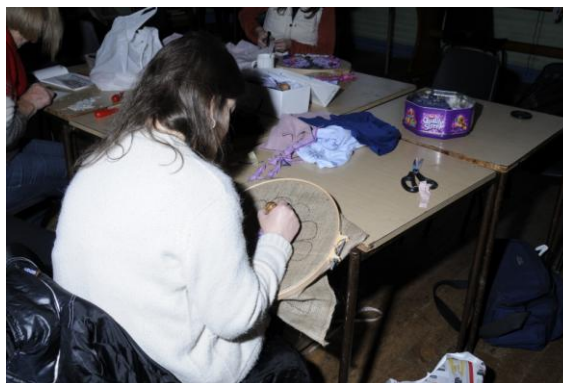
Figure 5.2. Companionable making on a winter afternoon in the Pendon Crafts Group

The pleasures of productive engagement were still present, although modified, when a collaborative task was involved. Satisfaction here was not always related to the intrinsic pleasures of flow, since it was often clear that these activities would not have been voluntarily chosen by participants unless framed as meaningful contributions to the collective: