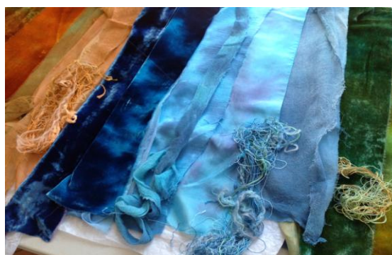
Figure 5.1. Strips of silk dyed by a member of Hellan Crafts Group

Now the [dyed silk] strips are laid out like this in all their glory, almost everyone else comes at some point and admires: ‘Did you do all this?’—‘I remember you doing some dyeing but I didn’t know they’d come out so lovely!’—‘How did you do this then?’ (Field note, Hellan Crafts Group, 08/04/14)