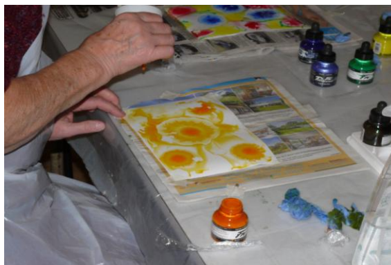
Figure 6.2. Experimenting with properties of water and ink in the Pendon Crafts Group (Photo: David Lidstone, 2014)

The particular materials used, if not too precious, could reduce burdensome feelings of responsibility and this had been identified as an aspect of AFHC's work with crafts elsewhere: