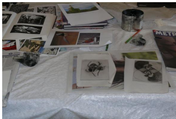
Figure 6.3. Making use of printed source materials in the Pendon Crafts Group

(unapologetically) thieving and acquisitive in relation to a body of existing works. Makers were thereby saved from reinventing the wheel, and not left feeling dependent on what they often perceived as their inadequate personal resources.