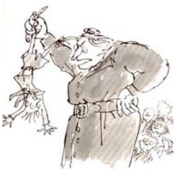
Figure 3: Matilda Roald Dahl 1988

In the essay ‘ Matilda, Existentialist Superhero,’ themes of morality are again explored and Roald Dahl’s Matilda is described as representing the Nietzschean concept of the Übermensch - the superhuman who sometimes breaks the rules of a prescribed morality through the use of her superpower of Telekinesis to overcome her Nemesis, the headmistress of her school, otherwise known as ‘ The Trunchbull ‘ and the machinations of her ignorant and abusive family. ‘ As the existentialist superhero, she finds ways to counter the obstacles they put in her path. Instead of becoming bogged down in feelings of victimhood or resentment, she uses her strength of character as well as her genius and superpowers to take the initiative to do something about her situation’ [19]