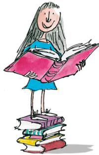
Figure 4 : Matilda Roald Dahl 1988

Matilda is described in the book as intellectually gifted (unlike her ignorant and neglectful family) and does not simply succumb to an externally imposed learning of morality, but decides for herself how she is going to live her life, in the true sense of the Nietzschean Übermensch , thus she does not blindly follow rules but makes her own informed choices. In the story we learn how she will creatively use her special powers to overcome a large, adult bully – The Trunchbull , headmistress of her school. We see also, how within the context of her bullying family, she uses her intellect to outwit them and we also come to understand how they are intimidated by her intelligence and try to disempower her. Quentin Blake’s illustrations of Matilda are rendered using his signature expressive outline that imbues the character with a sense of animation and playfulness. There is an innocence implied through Blake’s characterization of Matilda that remains throughout the illustrated version of Dahl’s classic that perhaps, is not necessarily reflective of her feistiness and wiliness in the face of her adversaries.