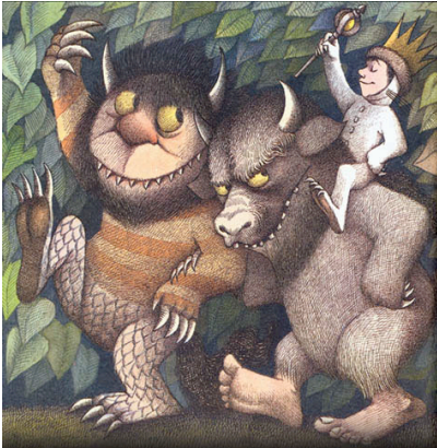
Figure 5: Where The Wild Things Are Maurice Sendak 1963

In the same interview, Joe Oyler expands on the fears that some parents verbalized, in that their own value systems, religious beliefs and codes of morality might be challenged if their children were taught to question systems imposed upon them within the family. He says, ‘ they were afraid it would inoculate their children against their own, parental indoctrination. ‘ [22]