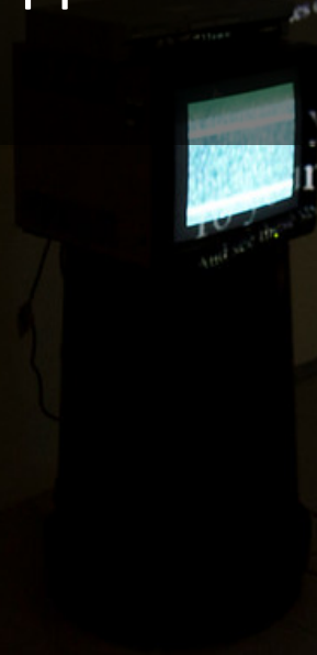
Falmouth School of Art online picture gallery (Falmouth Fine Art London exhibition)

The network examines 'the gallery' within an HE setting and its relationship to the learning, teaching and research associated with creative art, design and media curricula. It debates what 'the gallery' means within the context of new media and to support innovative approaches.