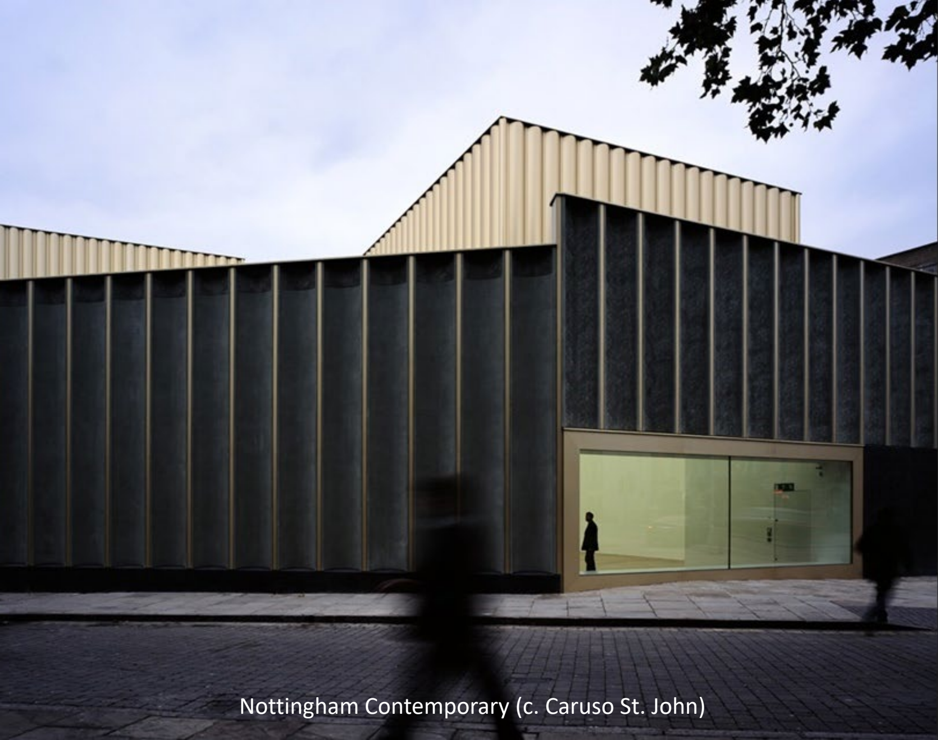
Nottingham Contemporary (c. Caruso St. John)