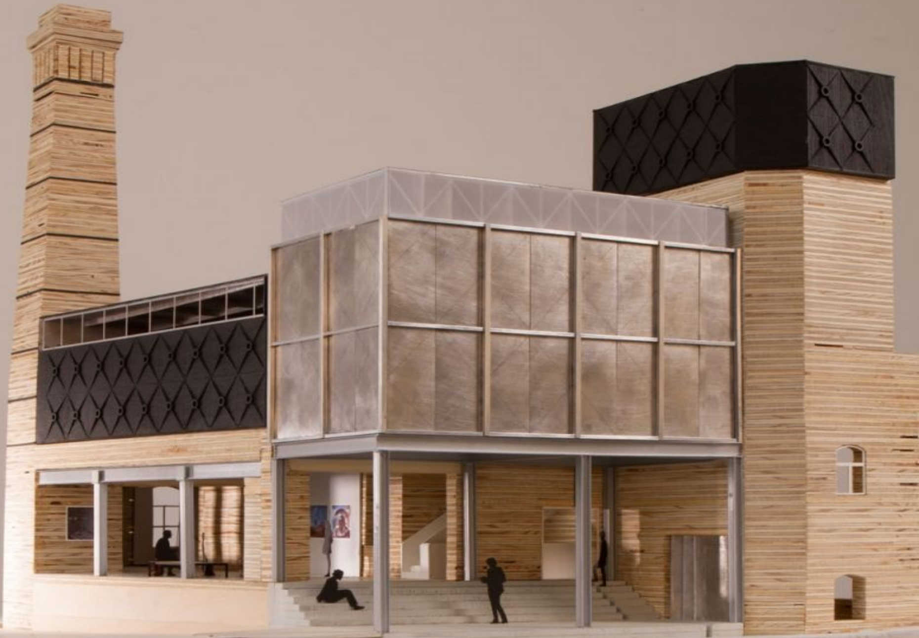
CCA Goldsmiths (c. Assemble http://assemblestudio.co.uk )