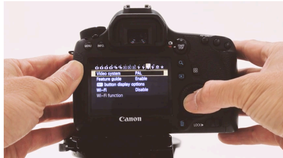
How to Set Up a Canon 6D (Mark 1) for Full HD Video