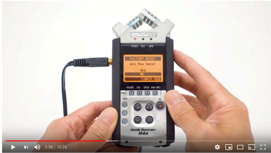
How to Setup a Zoom H4n - Zoom and Boom