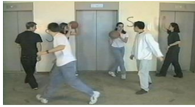
Fig. 3. The two teams were playing the basketball back and forth

Although this video is not special designed for our experiment, it is suitable for our studies. First, it has a counting task, and users may have different counting performance results. Second, users may or may not see the Gorilla when they were busy in the counting task. With the help of an EEG sensor, we can analyse whether different counting scores and the appearance of the Gorilla have effects on the users' attention level.