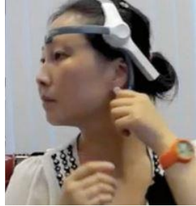
Fig. 1. MindWave EEG sensor

scale, a value from 20 to 40 indicates “lower attention”, while a value in the range of 1 to 20 indicates “lowest attention”[13].