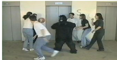
Fig. 4. The Gorilla walked across the players