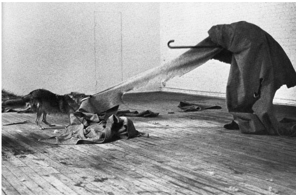
Figure 5. Joseph Beuys and Little John in Coyote: I Like America and America Likes Me. Animal and artist shared three days in an enclosed environment strewn with newspapers, felt, straw, and other objects. René Block Gallery, New York, 1974.

All well and good as an eco-sophical proposition, but there are unresolved questions here. What kind of coyote was Little John? What was his provenance, and does it matter? His purported status as a “wild” animal only recently caught and the degree of his prior interaction with human beings are unverified; and there are all sorts of discrepancies in published accounts. The animal’s untamed nature is often highlighted in these descriptions, and it serves to feed the mythological narrative of an interspecies encounter between these representatives of “nature” and “culture.” In reality it seems the coyote had been brought to New York from a ranch in New Jersey by his “owner.” 13 In one of Tisdall’s descriptions of the event, she provides a rare account of what happened after Beuys departed the caged space, as she remembers it: