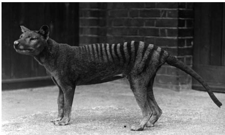
Figure 2. The thylacine is now almost certainly extinct. This 1913 photograph records the last one to be held in captivity in the London Zoo.

In this context, etymological definition generates proliferation of signification. A word—and a species—of uncertain origin, sometimes applied to people in either derogatory or playful fashion. Astronomical constellations, formerly used in navigation. Other creatures with certain physiological similarities, one of those mentioned now extinct and another on the cusp of disappearance; Thylacinus cynocephalus , also known as the Tasmanian tiger or wolf, was hunted to extinction in the 1930s, although there are still unconfirmed sightings to this day. Finally, mechanical grips/