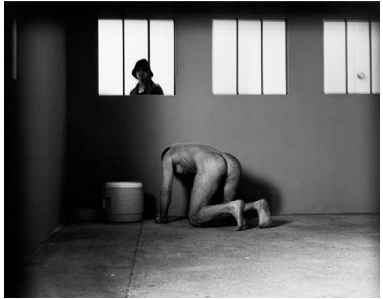
Figure 7. Oleg Kulik in I Bite America and America Bites Me. Performed at Deitch Projects, Grand Street, New York, 12–26 April 1997.