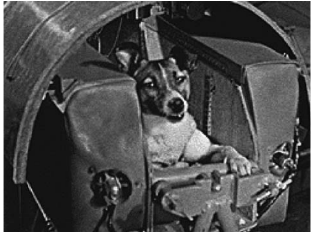
Figure 3. Laika, the first cosmonaut, inside the capsule of Sputnik 2, 1957.

In November 1957, when I was five months old, Laika became the first living creature to enter space, orbiting around the earth while I orbited my mother in extreme proximity. Found as a stray dog in the streets of Moscow and chosen for her small size and even temperament, Laika was about three years old when she became the first cosmonaut aboard Sputnik 2 and an unwitting instrument of cold war politics: an understudy for humankind in the complex ideologies and developing technologies of ballistic missiles, satellites, piloted space flight. In Russian, laika means "barker" and is the generic name for a range of Russian dog breeds. In a Soviet radio broadcast a week before the launch, Laika barked into the microphone on cue. The American press dubbed her "Muttnik."