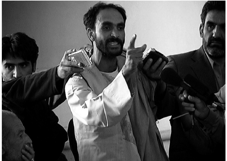
Figure 8 and 9. Abdullah Shah, aka "Zardad's Dog," during his trial for multiple murders, Supreme Court, Kabul, 15 October 2002 (top); and a witness at his trial. Stills from the video film Zardad's Dog by Ben Langlands and Nikki Bell, 2003. (Photos © Langlands & Bell)