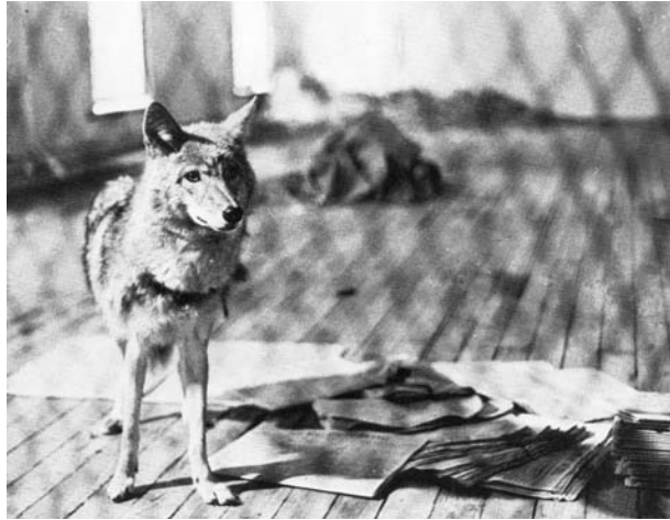
Figure 4. Little John , the animal companion in Joseph Beuys's iconic performance piece, Coyote: I Like America and America Likes Me . René Block Gallery, New York, 1974.

requiring our attention. Under threat since the arrival of European settlers, the coyote had become the quintessential American scapegoat or underdog, hunted and destroyed as a pest, and yet it had more than survived. For Beuys, the coyote had its prehistoric origins as an Asiatic steppe wolf (see Kuoni 1990:213); he believed it had crossed from East to West on ice in the Bering Straits thousands of years ago, like the ancestors of Native Americans. So Beuys's coyote was originally Eurasian, and intimately linked to the Siberian wolf, another creature traditionally connected in Siberia and Northeast Asia with shamanic transformation.