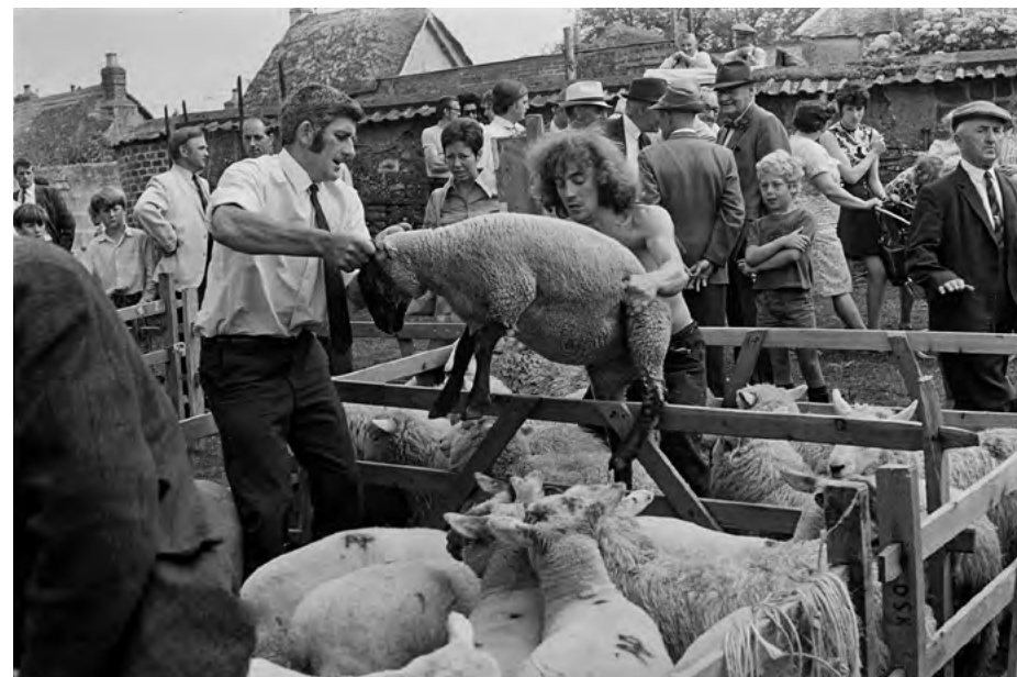
Roger Deakins, Beaford Archive | Black Swan Arts

Full details at photofrome.org/exhibitions