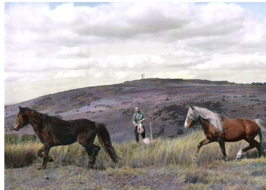
Leah Gordon | MPB @ Rook Lane

Based on last year's enthusiastic reception, Frome's unique late-night venue also becomes a photo gallery for the duration