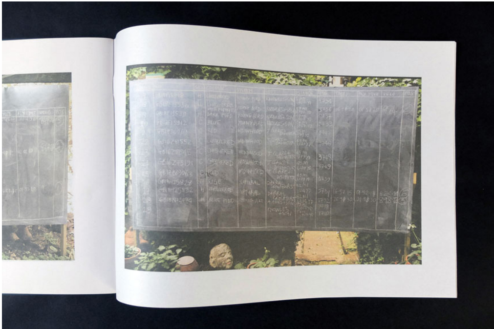
Clockwise images 2, 3, 4, 5, 6, 7. Images 8, 9