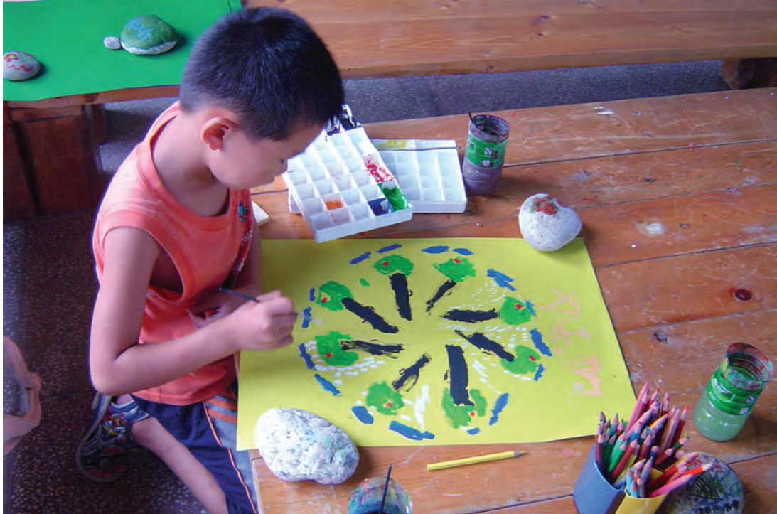
Figure 16: Painting weather mandalas.