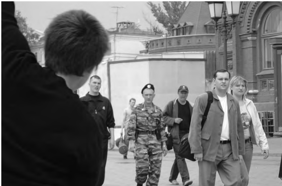
Figure 6d: Red Square Maple 4.

Because when performing a Twig Dance I am not asking for money, or qualifying my dance with some sort of request for support, and because I choose public spaces without direct associations to commerce or entertainment (the only requirement is that a tree be prominently located there) I am positing an unusual relationship between people and trees in an urban or humanized environment: I re-territorialize myself in relation to the spectators when I perform to unpaying, unsuspecting audience members; I re-territorialize my body in relation to the tree by focusing my performance on it (rather than seeing a tree as a decorative object of scenery to be passed by or ignored, I study it by dancing its suggested score); furthermore, I re-territorialize improvisation performance as an event which can happen on a city street as easily as a country road or a suburban park 2 , and which can invite the attention of people