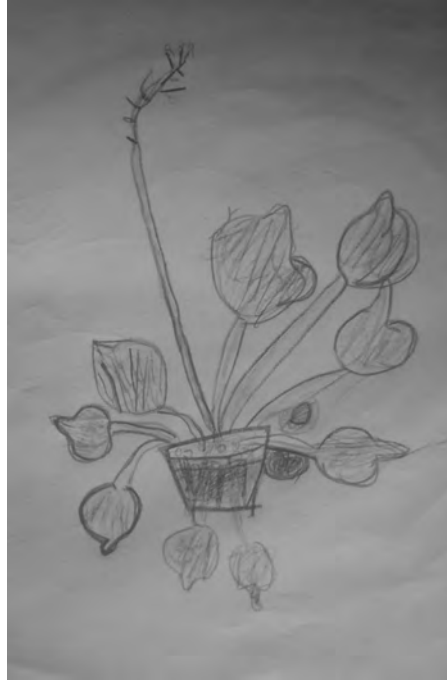
Figure 13: Orchid.

Emily called out to them. According to our translator Elena they are quite used to learning by call and response in school and so this likely accounts for their enthusiasm for something a bit familiar amidst all our unfamiliar activities and requests. [...]