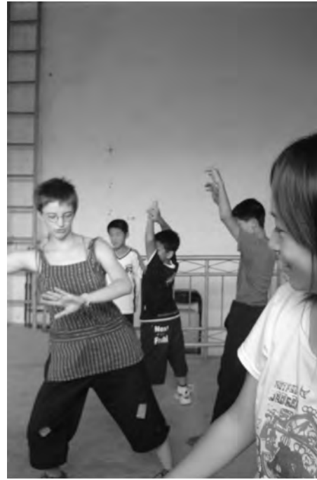
Figure 3b: Improvising with different qualities.

produced an art exhibition of the children's work. Additionally Richard and I recreated one child's drawing of a plant as a mural on the side of the local natural history museum building, and created an art video, 'Twig Dances in Nanling', in which children on the programme performed dance improvisations with plants in the Nanling Forest.