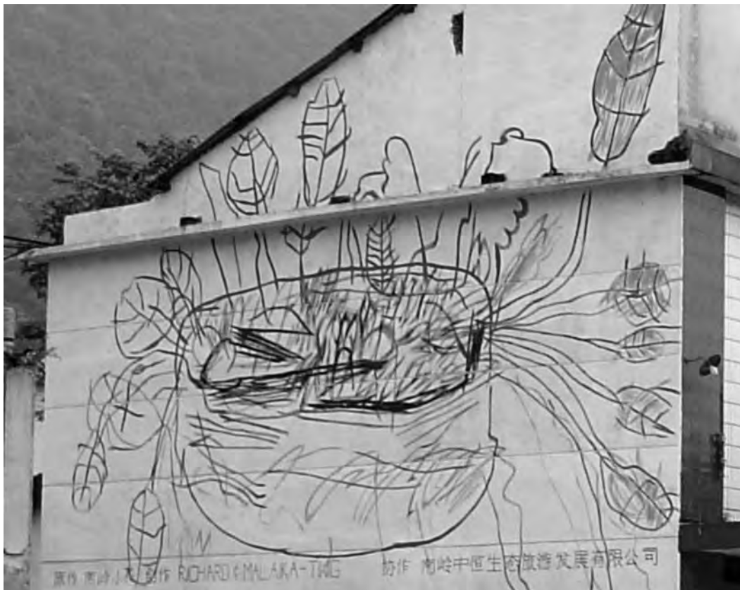
Figure 18: TWIG mural in Ruyang village, designed by workshop children.