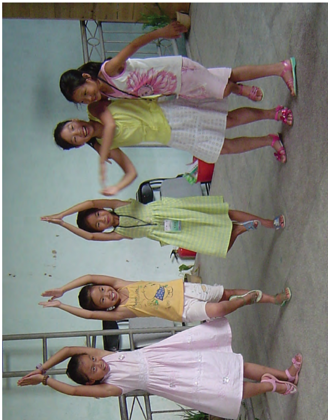
Figure 10: Time for 'Tree'.