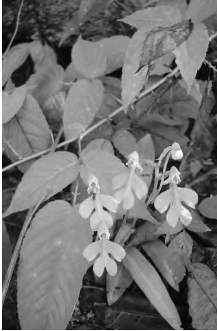
Figure 3a: Red flowers in Nanling Forest.