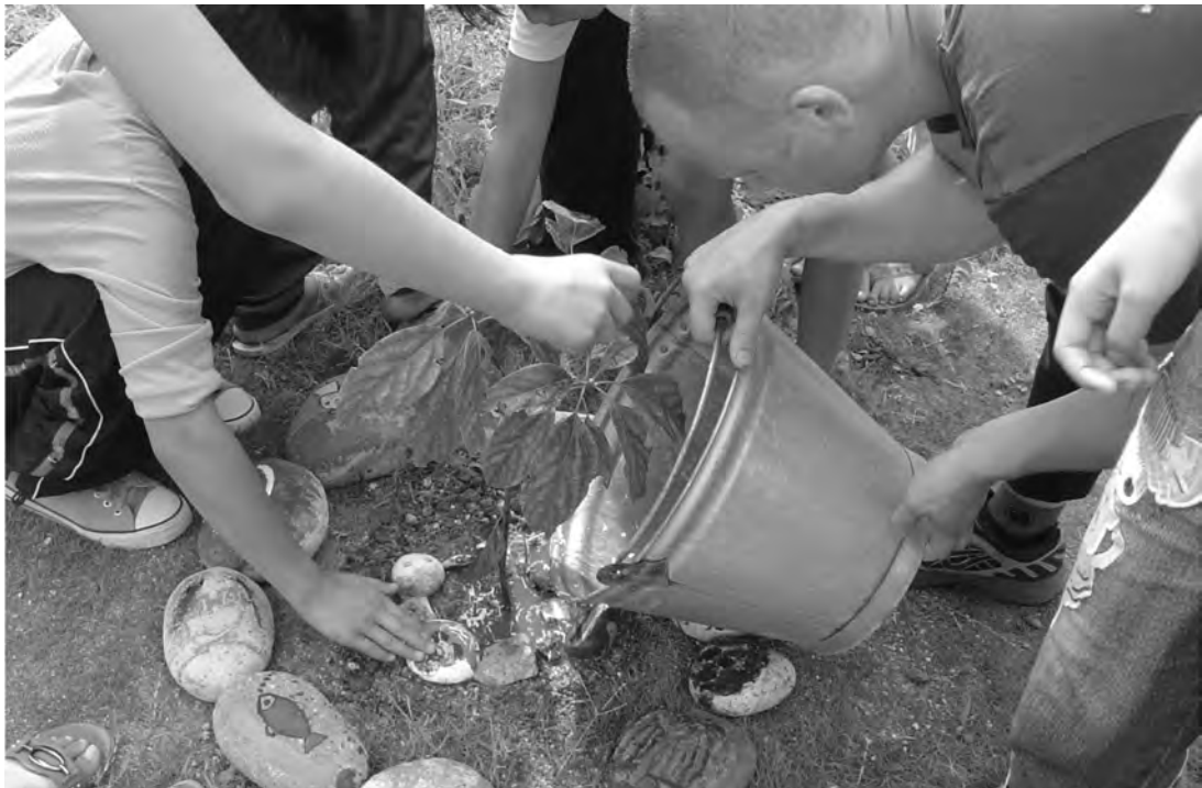
Figure 1: Planting a tree in the garden of Ruyang Primary School, Guangdong.

ecology improvisation dance performance community perception