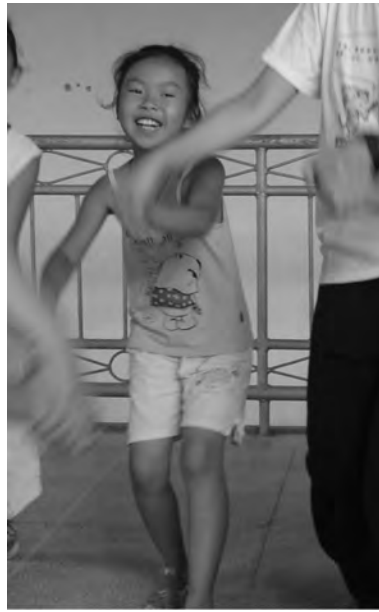
Figure 12: Playing with waves of movement.

able to introduce 'radical' ideas – such as dancing with plants – to the children, and were met with their total curiosity and interest. In our chosen space, many new things became possible.