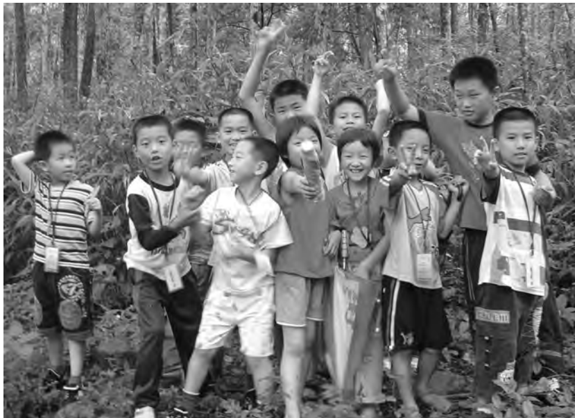
Figure 7: The Green Group.

Toward this goal of widening our perception to include happenings in the social as well as natural environment, we asked ourselves how can an improviser's ecological awareness incorporate political awareness? How