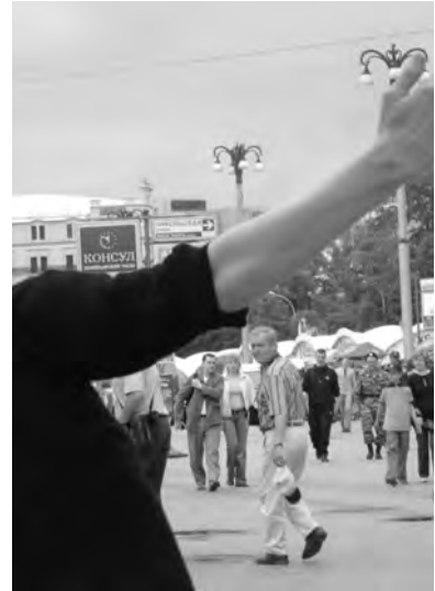
Figure 6a: Red Square Maple 1. Figure 6b: Red Square Maple 2. Figure 6c: Red Square Maple 3.

the sun and spreads out its greenery wide... These leaves have sharp tips, are flat-surfaced, and grow outward in strong veined flaps of pointed green; I can feel my response in pointing fingertips as my arms reach out and up, swaying slightly in the tickle of a breeze. I can feel the turgidity of these leaves, their strong centers and slightly floppier bat-wing style webbing between them; my skin stretches across my shoulders in response, and I can see a young Russian businesswoman looking at me. I look back at her as the tree might, indiscriminate but aware, acknowledging her acknowledging me, including rather than controlling or suggesting anything with my gaze. She continues to stare, a dubious look upon her face... flick! I flip my torso toward and away from the tree in a leaf-flapping manoeuvre.