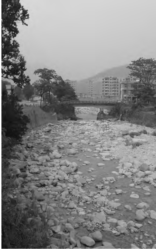
Figure 8: Ruyang village, next to Nanling Mountains.

apart) only once or twice a year. Of course, the factories providing these jobs and conditions are most often the multinational industries producing cheap goods for western countries' consumption. Furthermore, these industries frequently build in China because of its lenient environmental legislation for businesses, making the country, and Guangdong especially, famous for its growing industry-related pollution (Reuters 2008). As a result, the people living in Ruyang are quite dependent upon the income from nearby factories for their livelihood, and many view the escalating development of the area as a good thing. However, Ruyang borders Nanling National Forest Park, one of the largest areas of untouched forest in Guangdong province, and the encroaching industry from surrounding areas threatens the wilderness with development. With TWIG, we aimed to cultivate in the children of Ruyang an equal appreciation for the natural local environment, in order to spark a greater sense of pride in and care for their relatively intact wilderness surroundings. In this way we sought to transcend cultural differences to identify care for our environment as an omni-cultural concern.