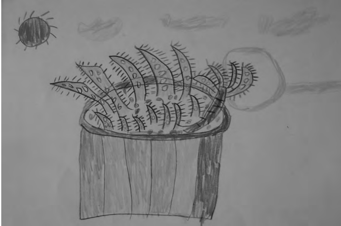
Figure 14: Aloe.

communicating across the language barrier (even though we had translators) taught us to use our whole body to illustrate an idea and to listen more thoroughly to others without the aid of verbal comprehension.