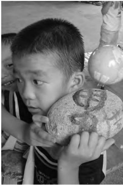
Figure 11: Painting Rocks.