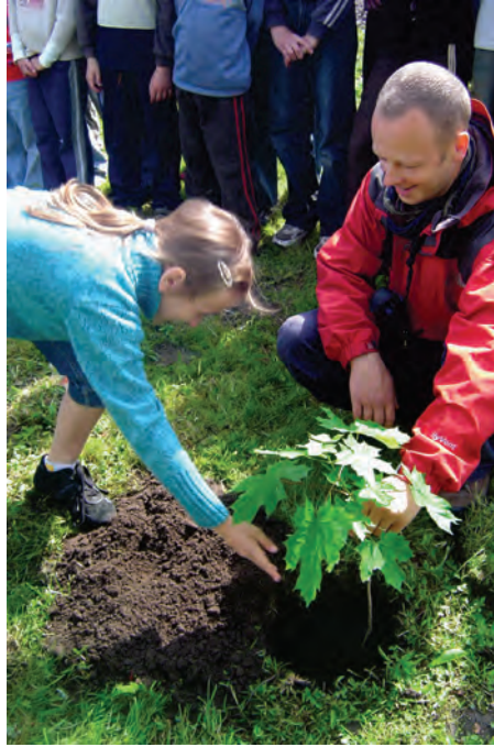
Figure 4: Tree-planting at Grommotte Primary School, Poland.