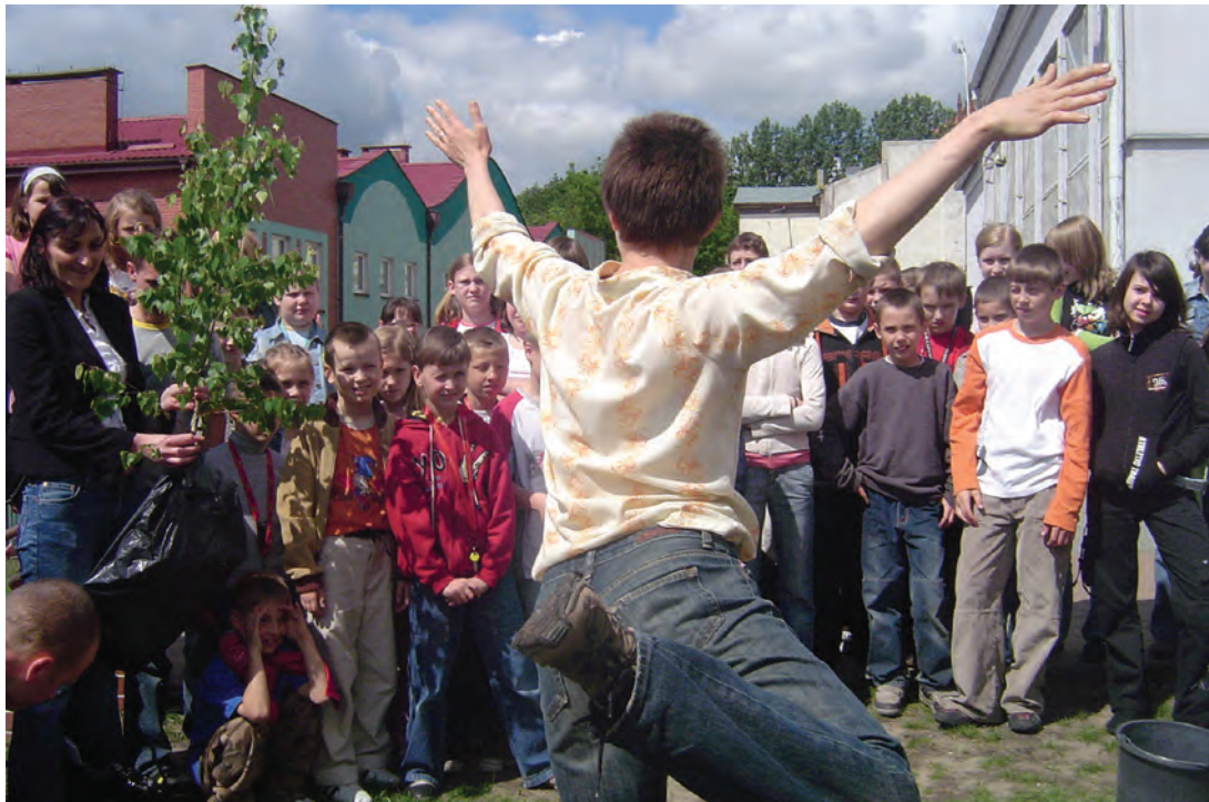
Figure 5: 'Twig Dance' at Ilawa Primary School, Poland.