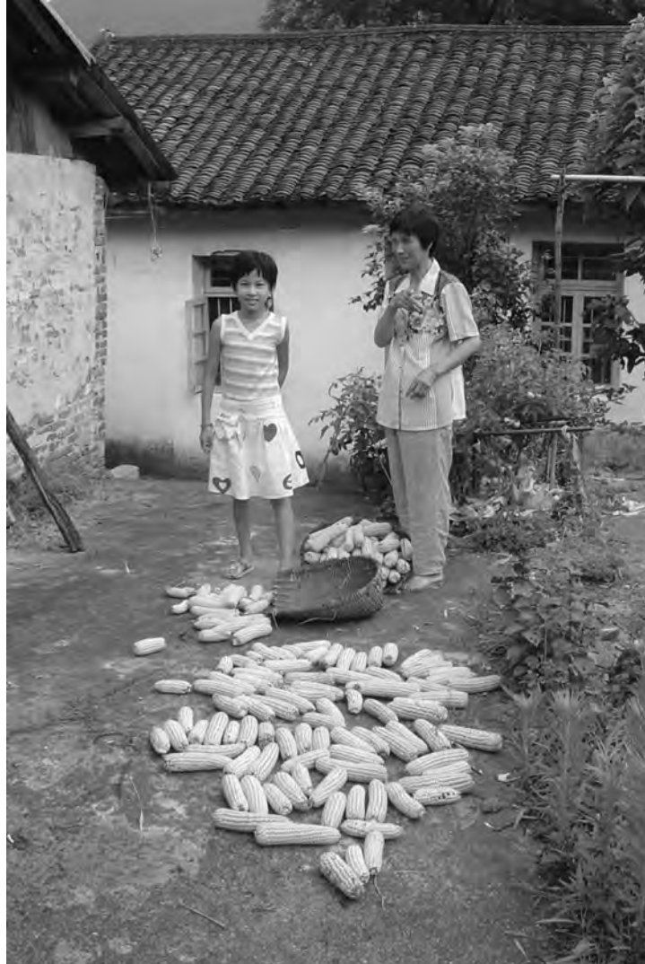
Figure 9: Granddaughter and grandmother in Ruyang village.

health is the single most pressing current issue and simultaneously the most effective means of combating social and economic disparity. His book brings the environment to the forefront of consideration in international policy, highlighting how international policy that values capitalism as economic growth is the single biggest obstacle to working to combat global warming. Because the structures of international banking operate in a way that implicitly under-prioritizes the environment and makes social justice a back burner issue, Simms states that to reign in global warming, international governing bodies must agree to address social and ecological imbalances on a global scale, thus requiring rich, polluting countries to pay off their ecological debt to poor countries.